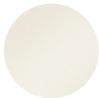
Acid etched white glass