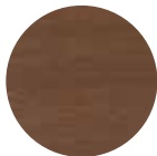
Walnut stained ash