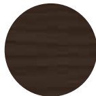
Carbon stained ash